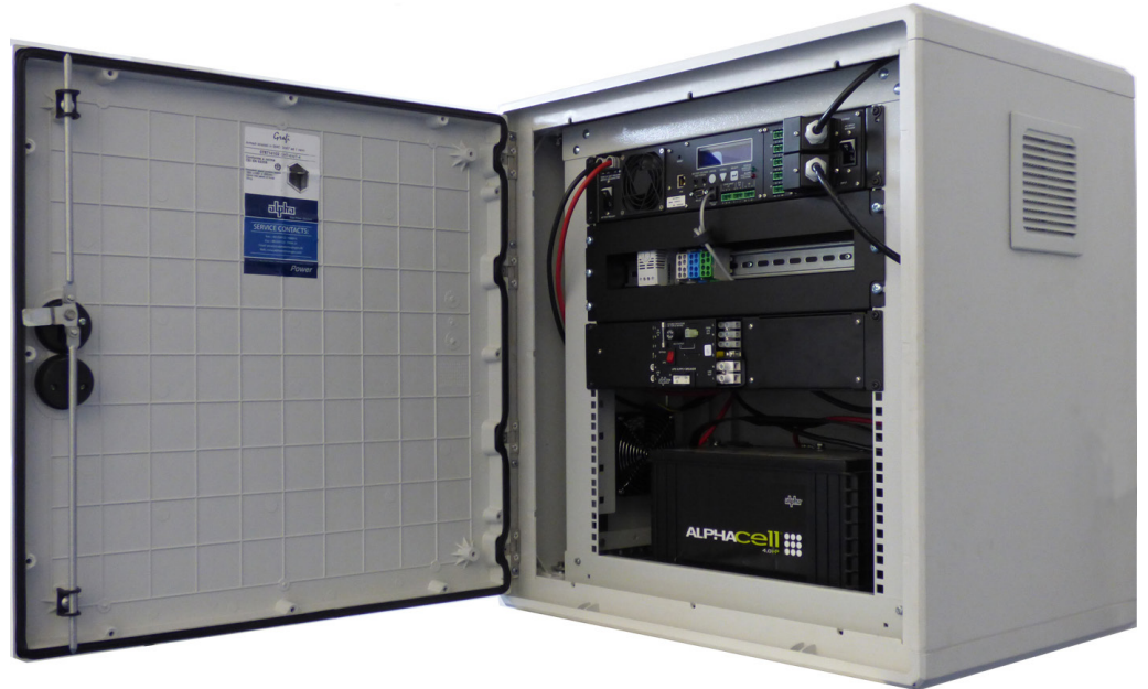
Atrox 55-650 incl. optional UATS

IP55 Power System for Harsh Indoor and Outdoor Environments